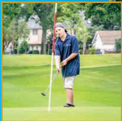
Lake Park Golf on page 28