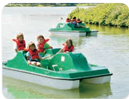
Paddle boating on Lake Opeka