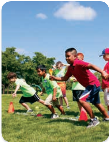
All-Camp Field Day