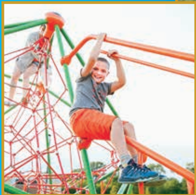
Park It! on page 5