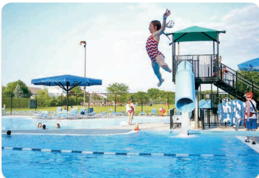
H2O Night at Chippewa Pool

Registration for all swim classes ends on the Friday prior to each session's START date.