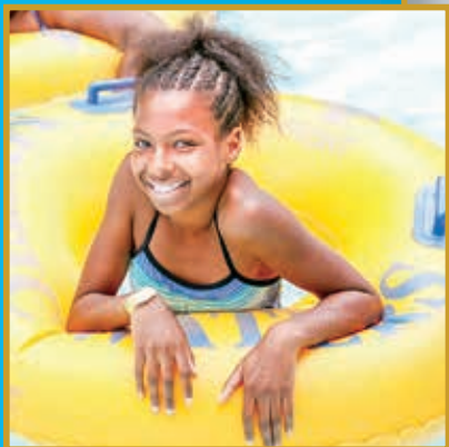
Mystic Waters on page 14